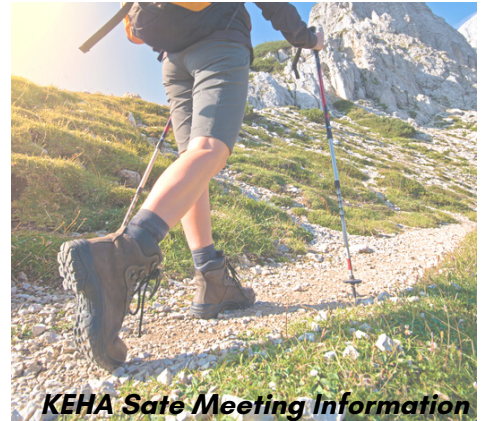
KEHA State Meeting Information