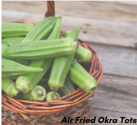
Air Fried Okra Tots